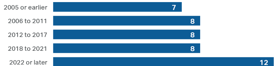
Among teachers who took at least one week of parental leave; totals include paid parental leave, other paid leave (e.g., vacation time or sick leave) and unpaid leave.

Based on year of most recent parental leave